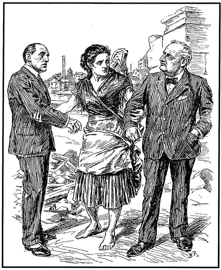
The Need For Judicial Clarification