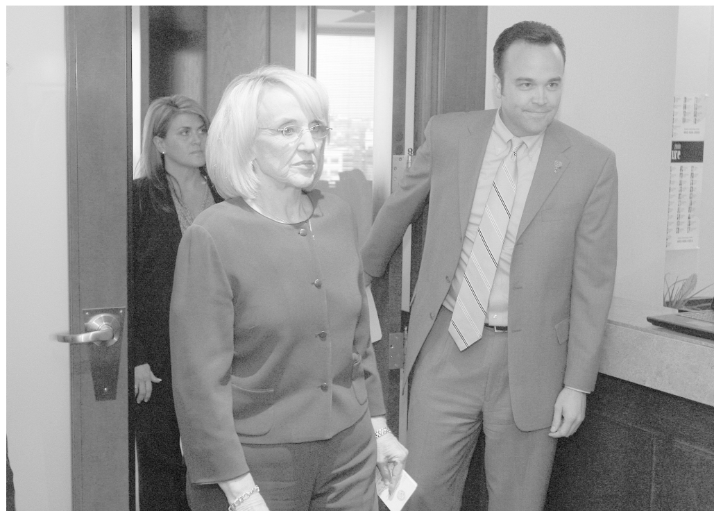
Arizona Gov. Jan Brewer, after meeting with Obama Administration officials regarding the border and immigration, walks into a news conference Monday, June 28, in Phoenix.

It is time to recognize the legitimate frustration of our state and local governments and school districts that are hemorrhaging money to pay for the status quo, but without having any controls whatsoever over those costs. Of course, there will still be problems, but these changes will allow